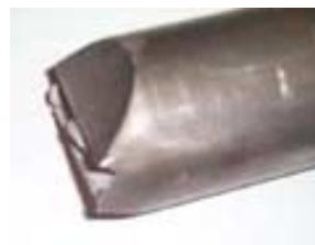
Normal "Pinch" Cut